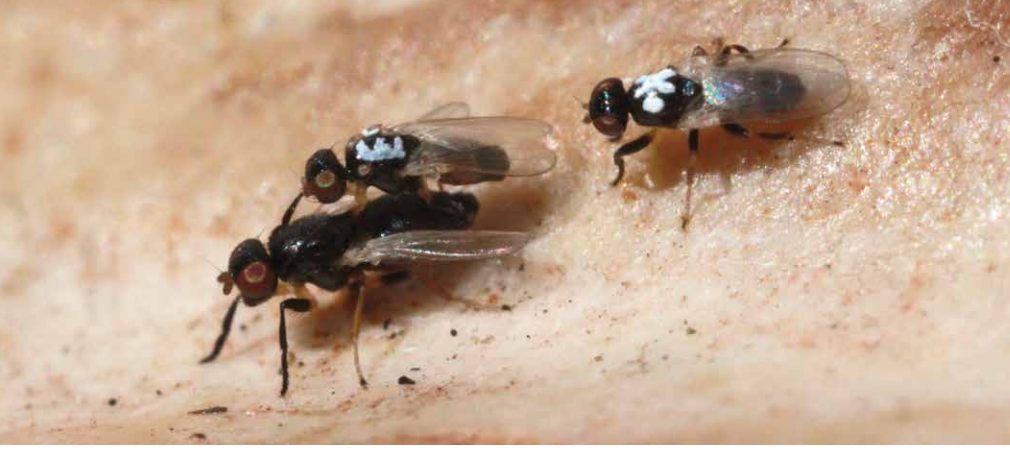
On the surface of a Moose antler, one male Antler Fly marked with an "E" guards his mate from a rival marked "X".

Approximately a week later, the eggs will hatch into tiny white maggots, less than a millimetre long, that feed on the bone marrow left inside the antler. Protected within their bony nursery, each little larva will grow to about 10 times their initial size over about a month and a half, growing to the size of a grain of rice. If summer ends before they are fully grown, the maggots remain inside the antler through winter's deep freeze. Eventually spring comes, and they thaw to finish growing.