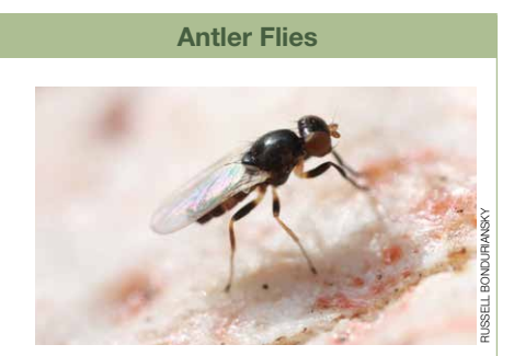
Antler Flies prefer fresh antlers.

The story of the Antler Fly is far from over. They have only been known for a few decades: we have learned a lot from them, but there's much more to discover. No one can say what scientific insights they still may provide us. The flies themselves have no time to wonder. They still have the same goal they always had—do whatever it takes to find a mate! So, the next time you come across a discarded antler, take a closer look and watch the Antler Flies' tiny world of love and war unfold.