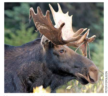
Moose shedding his velvet.