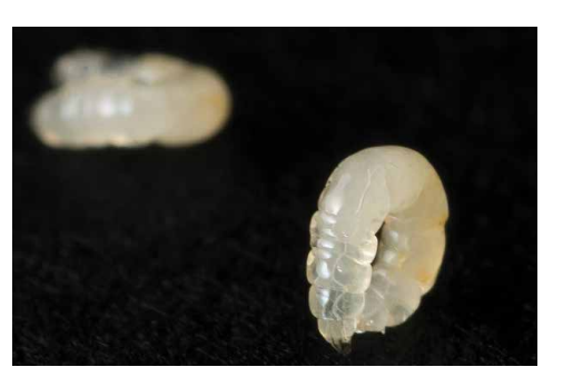
An Antler Fly larva, photographed in the lab, curls up as it prepares to leap. Its head is on the bottom left.

The largest, strongest fighters drive other males away from the cracks and pores in the antler where females gather to feed and lay their eggs. Female Antler Flies don't accept advances from just any male, though. They use their antennae to smell the waxy molecules on a suitor's body—the perfect mate is not just big and strong, he must smell good too! While most of the activity takes place on the antler's surface, mating takes place on the underside – hidden away from rival males and potential predators.