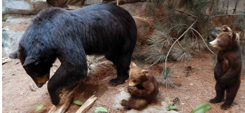
Black Bear exhibit at the Algonquin Visitor Centre. DAWN SHERMAN

The best way to appreciate this marvellous facility of course, will be to see it firsthand but we also think it worthwhile to tell you a bit about the thinking that led up to the final design. In our view a museum or visitor centre can never be a substitute for the real