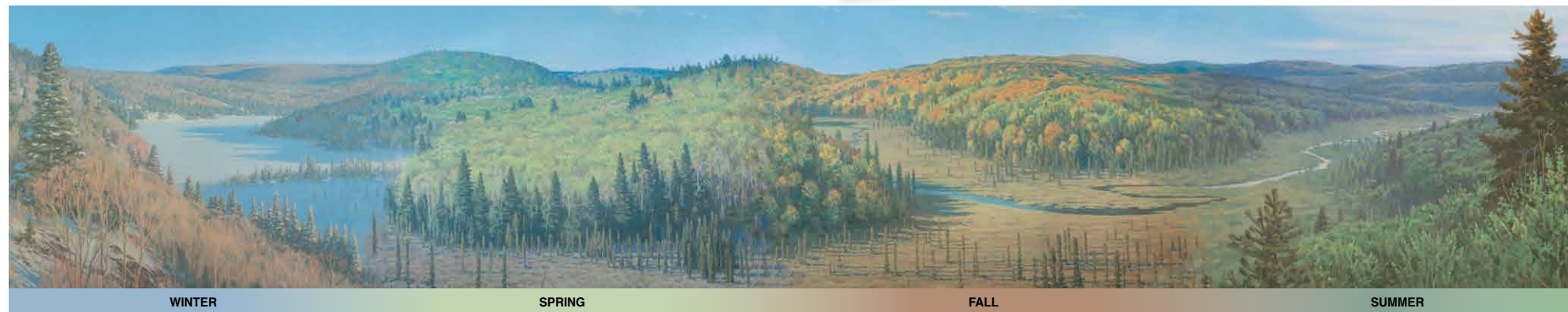
Illustration of Sunday Creek in all seasons as it is viewed from the Visitor Centre deck. PAINTINGS BY DWAYNE HARTY

Available at the Algonquin Visitor Centre Bookstore & Nature Shop, East Gate and West Gate, or online at algonquinpark.on.ca