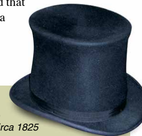
"The Regent" style Beaver Felt Hat, circa 1825

important refuges for many kinds of wildlife, but we don't often think of what is happening inside the lodge, and that the beaver itself is a habitat!