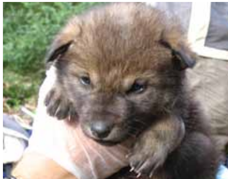
Six week old wolf pup.