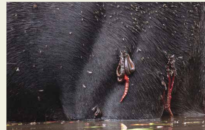
These North American Medicinal Leeches on the hind end of a Moose are full of blood. Once fed they won't need to eat for weeks or even months. Moose flies also feeding on blood are seen above the “high water mark”.