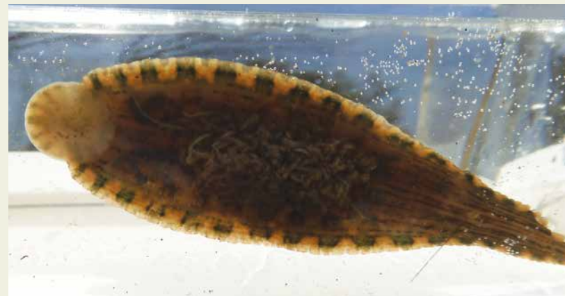
This Smooth Turtle Leech was found in a pond in early spring. It has dozens of young leeches on its underside. Smooth Turtle Leeches are boldly patterned on the back, and underside, note the checkered edges and stripes.