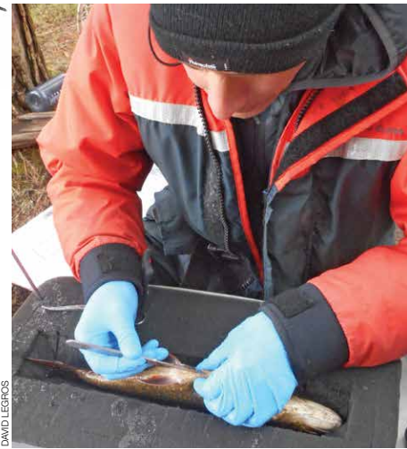
Fisheries researcher implanting transmitter.