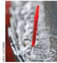
If you catch a fish with a red tag, please release it.

For more information see the bulletin boards or park office.