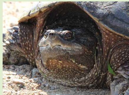
Snapping Turtle: Be careful to avoid its jaws as it will feel threatened and may snap!