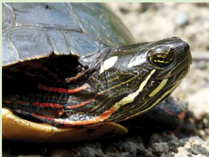
Painted Turtle: Note the brilliant colours!