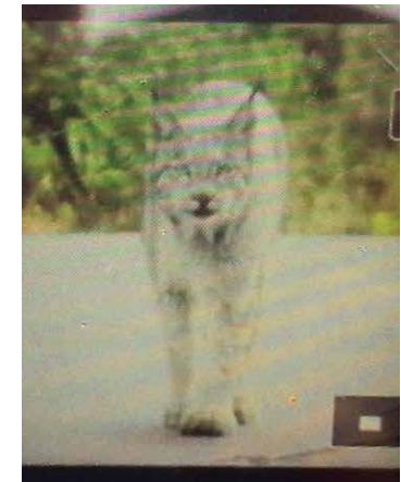
Lynx observed on Opeongo Road on October 6, 2017.

sometimes, you get lucky! A few days later, when looking through observations on the citizen science website, iNaturalist.org, we spotted an observation of a Lynx, in Algonquin.