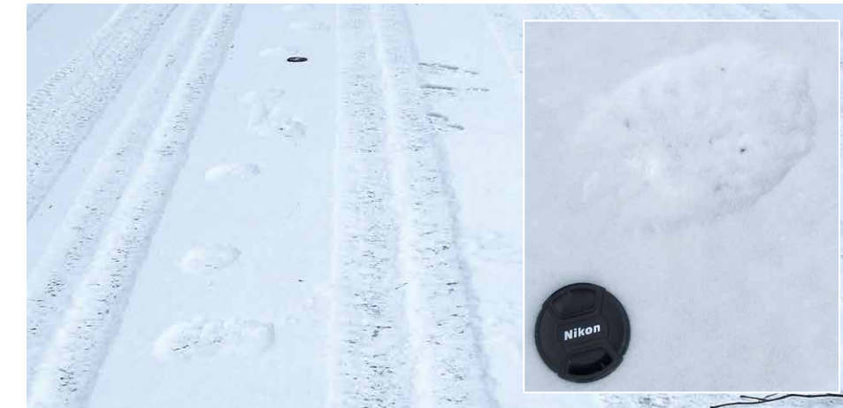
Lynx tracks photographed on Opeongo Road on November 11, 2017.

ontarionature.org/oraa/app/ – Submit your reptile and amphibians sightings from Ontario!