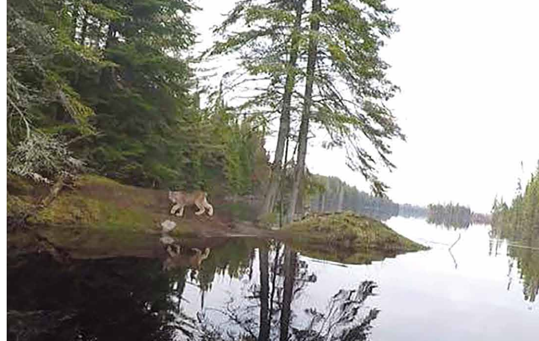
Lynx observed by park visitor at Hailstorm Creek on May 17, 2017. ACE CAMPBELL

Just over a month after the “first sighting”, we received reports and confirmed Lynx tracks, again on the Opeongo Road on November 10th. By this time, a nice skiff of snow had fallen on Algonquin, and the tracks of mammals were easy to find. An observant photographer noticed the large, round tracks heading down the road, eventually crossing and returning into the forest. The following day, the photographer saw more big, round tracks again farther south on the Opeongo road. The fresh snow that had fallen over night assured us they were new. The tracks seen on the road do provide some indication of the Lynx’s lifestyle. The footprints left behind in the shallow snow were not just big, they were enormous for an animal that is approximately 70-100 cm in body length and weighing 8 to 15 kg. The tracks were almost